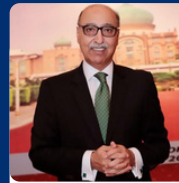
Amb. (Retd) Abdul Basit