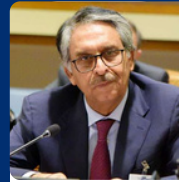
Amb. (Retd) Jalil Abbas Jilani