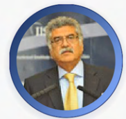
Amb. (R) Zamir Akram