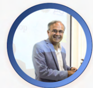
Amb. Asad Majeed